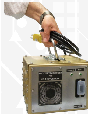
Rugged Portable 3.3 KW Transformer