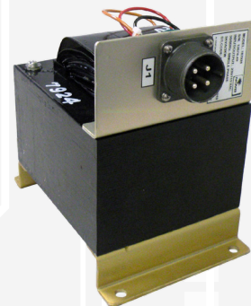
Custom 3KW Freestanding Transformer with MS Connector

Customers are encouraged to e-mail complete specifications or call to discuss such applications with a project engineer so that we can tailor our solution to your specific needs.